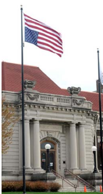
Vermilion County War Museum