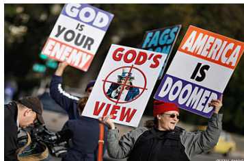
Westboro Baptists Protesting at Military Funeral