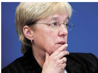
Washington Senator, Patty Murray

"No matter what war or what conflict, when they come home," veterans will "have me to be their top advocate in the United States of America," said Murray,