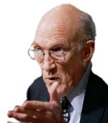
Alan Simpson, Republican and ex-Senator

"We don't condone those comments. Sen. Simpson has and will continue to serve on the commission."