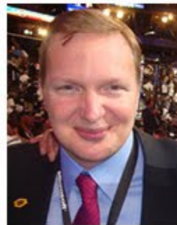
White House Deputy Chief of Staff Jim Messina

2. Let's just pretend that the President of the United States really does work for the Department of Defense, and not the other way around. And that therefore the poor insignificant commander in chief has no