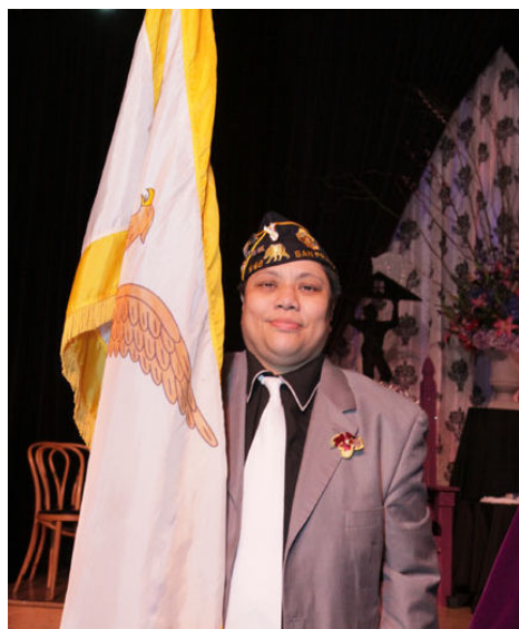
On 28 FEB 09, the Imperial Council of San Francisco held A Night of High Fashion on the Red Carpet: Coronation 2009 . Post 448 attended and provided the color guard at the gala event.