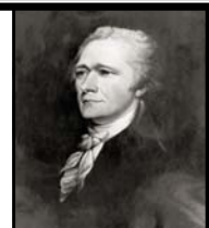
Alexander Hamilton (1755-1804)